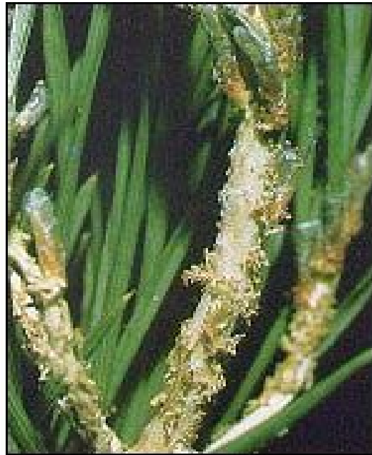
Pales weevil feeding damage: left, girdled loblolly pine seedling; right, twig of Scotch pine Christmas tree.