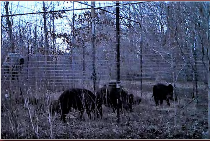
Feral hogs in a fence entrapment .

There are various configurations to suit the needs and budget of almost anyone wishing to minimize the impacts of feral swine. Higher-priced equipment/trap components can consist of cellular devices, high-tech cameras, solar panels, etc. Such components can send real-time video footage, text/email pictures, and/or remotely trigger traps which allows the control operator the luxury to choose exactly when to close the trap.