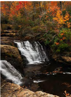
On the Cover: Autumn in Desoto State Park in DeKalb County.

32 FIREWISE USA: Residents Reducing Wildfire Risks by Coleen Vansant