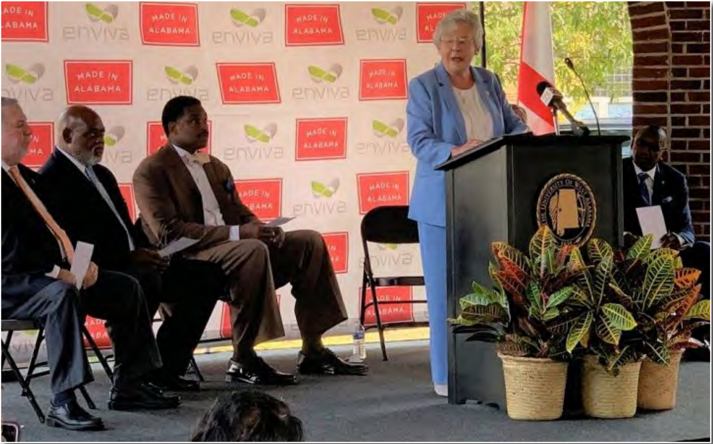
Gov. Kay Ivey announces Enviva's plans for a $175 million wood pellet plant in Sumter County.