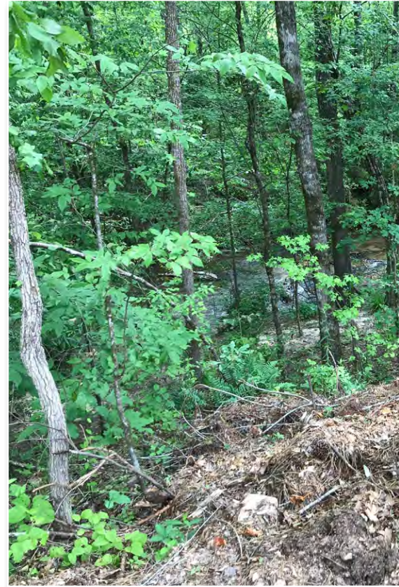
A well-made Streamside

A good road buffer also protects you and your vehicle from getting whacked by overhanging limbs in the road. Keep this idea in mind if you get tired of trimming roads each year with a pole saw! I would suggest planting these buffers along roads with a perennial clover. This type of clover will re-seed itself each year with proper maintenance. Perennial clovers also provide a year-round food supply for many wildlife species. Roadside buffers are also good bugging and strut zones for wild turkeys. You can tell that I like to hunt turkey, right?