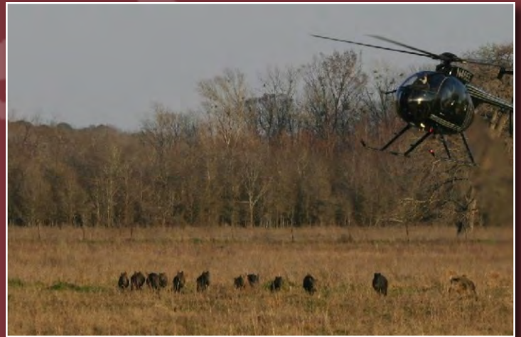
An aerial euthanization effort against feral swine.

Under the right conditions (cold temperatures, winter leaf-off, habitat, etc.), utilizing aerial removal activities can be an effective approach in covering large acreages in a short timeframe. Additionally, this technique can be utilized to euthanize trap-shy swine or solitary boars with a large home range. Aerial support should be considered as an additive management tool for feral swine control. Other removal tools (trapping, firearms, etc.) are needed to make an overall impact of feral swine associated damages.