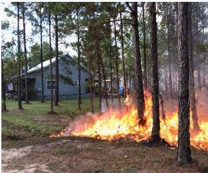
A wildfire came a little too close for comfort to this home in Marengo County.