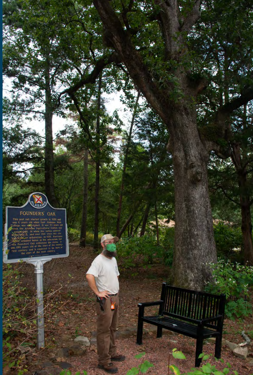
The Founders' Oak is known for being the 'heart' of the Davis Arboretum. It was planted 170 years ago, six years before the establishment of what is now Auburn University.

As most people are aware, oaks and Auburn go hand-in-hand, making this species the garden’s first serious collection focus. The APGA sent a mentor to evaluate the collection for certification into their Plant Collections Network (PCN). This collection had mostly singular specimens of 27 of Alabama’s 39 oak species. Seven years later, the Arboretum received full accreditation for its oak collection, and was functioning at a world-class level. A plant accessions database was built to allow for an acorn collecting program that was awarded grants, tracking of provenance information, and bringing in the missing 12 species of oaks. The attention to detail meant that the new specimens would maintain value for education, conservation, research, aesthetic value, and as any native tree does, become a functional part of the local ecosystem.