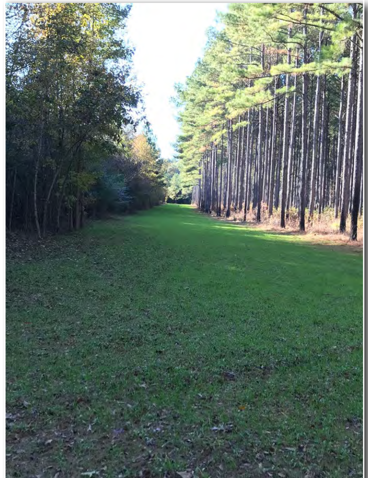
A successful reforestation effort next to a wildlife opening.