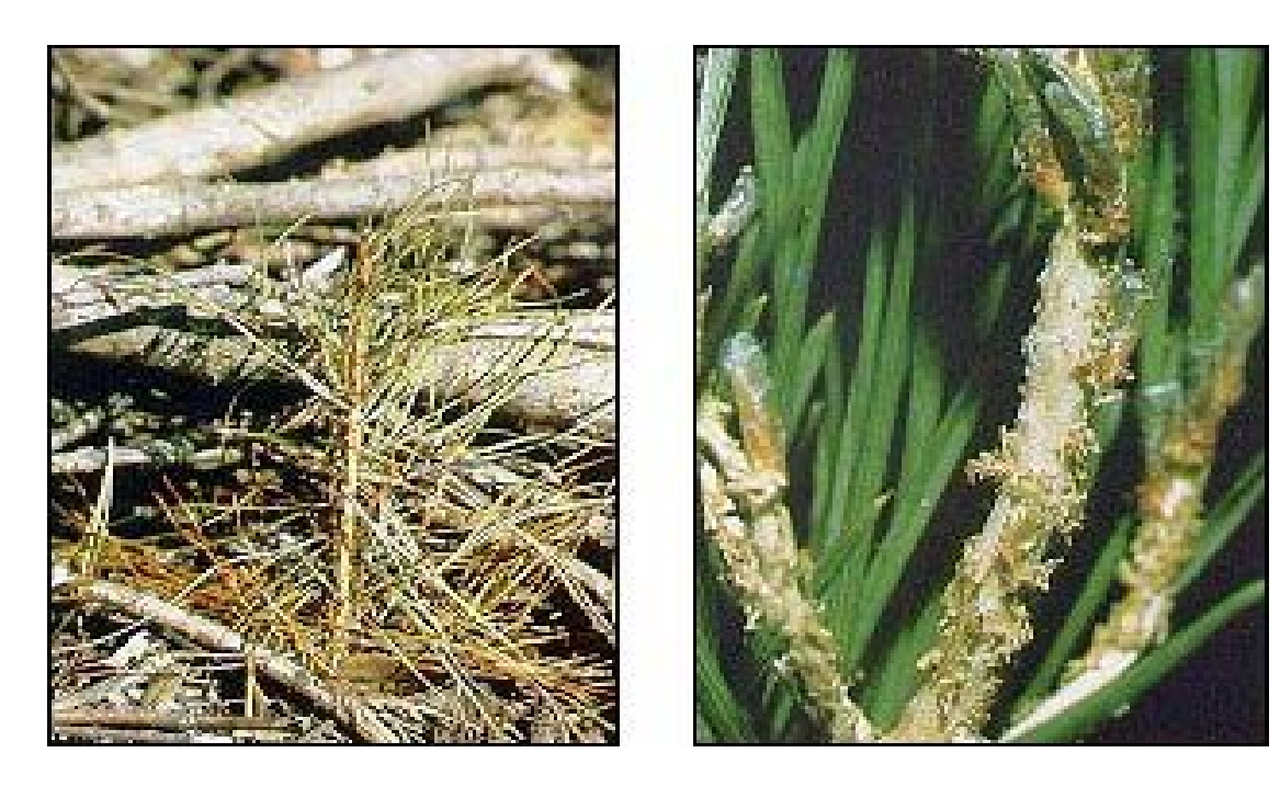
Pales weevil feeding damage: left, girdled loblolly pine seedling; right, twig of Scotch pine Christmas tree.

CHEMICAL CONTROL : Forest control: Spray foliage with 0.5% Malathion<sup>™</sup> (mix 6 ½ pts. 57% Malathion<sup>™</sup> E.C. with 100 gallons of water or fuel oil; or 2 T/gal.) or 0.5% Sevin<sup>™</sup> (mix 5 lbs. of 80% Sevin wettable powder with 100 gal. of water; or 2 T/gal.) Shade tree control: Hand pick and destroy larvae or spray with above mixture using WATER instead of fuel.