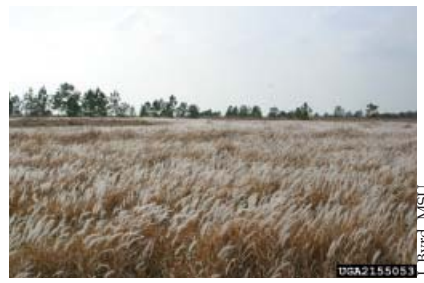
Open Area - Dense Flowering