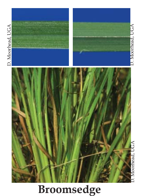
Leaves are thin and often curled, and arise from apparent stem.