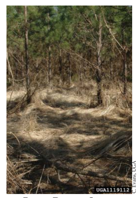
Forest - Dormant Season