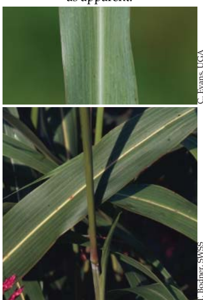
Johnsongrass Leaves wider than cogongrass, edges are not serrate.