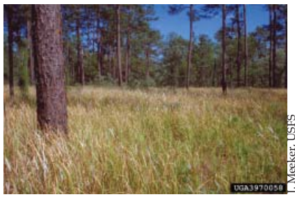
Open Area - Sparse Flowering