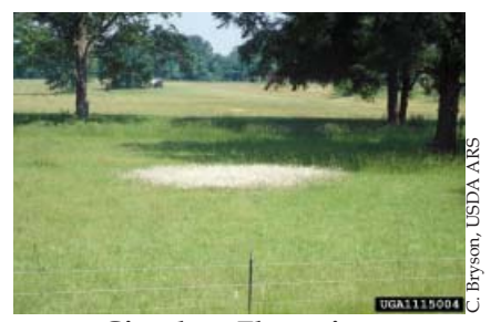
Circular - Flowering