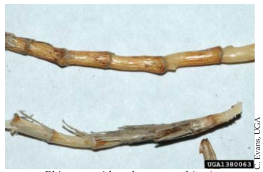
Rhizomes with scales removed (top) and intact (bottom)