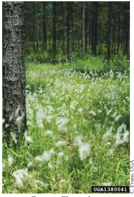
Forest - Flowering