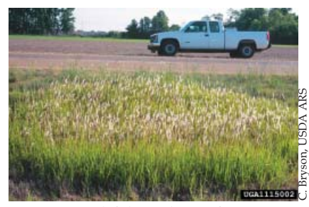
Roadside - Flowering