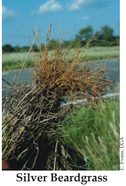
Silver Beardgrass Root system fibrous, lacking rhizomes.