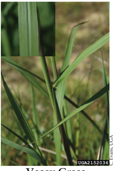
Vasey Grass Leaves arise from apparent stem, and serrations are not as obvious.