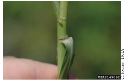
Johnsongrass Smooth collar, not hairy except for a small white hair-patch behind ligule.