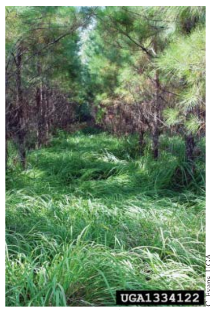
Forest - Non-flowering