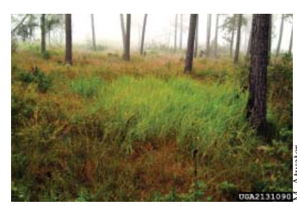
Circular - Non-flowering