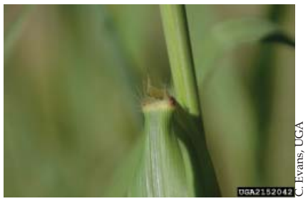
Vasey Grass Only membranous ligule is hairy, leaf collar flared, giving the region a less rounded look.