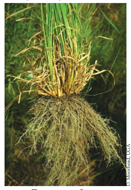
Broomsedge Root system fibrous, lacking

Thin root system, not extensive and lacking thick, segmented rhizomes.