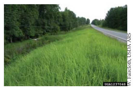
Roadside - Non-flowering